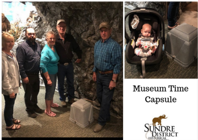
Museum Time Capsule

No charge for veterans showing their CFI Card